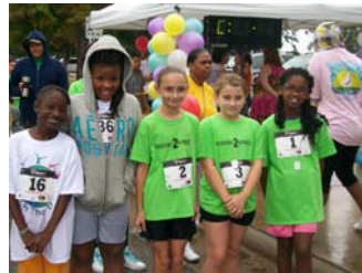
Passport 2 Fitness participants at the Waterway 5K/Fun Run