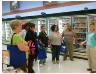
Healthy Living participants on a grocery store tour at Farm Fresh